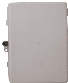
P1500G Front View