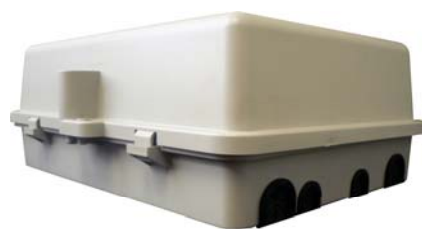
P1500G Side View

Inside Dimensions: H: 14.1" X W: 10.0" X D: 5.25"