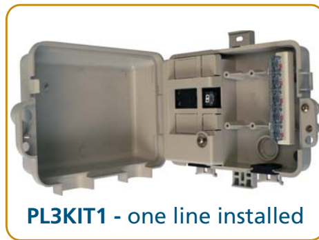
PL3KIT1 - one line installed