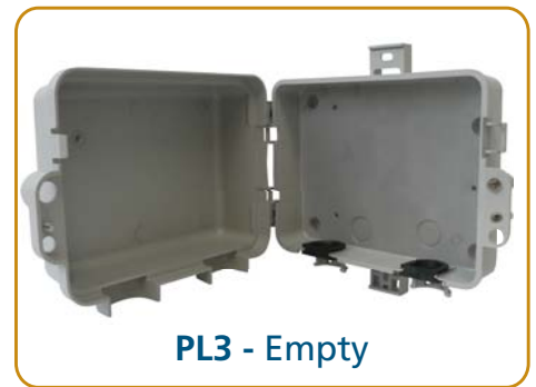
PL3 - Empty