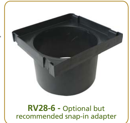
RV28-6 - Optional but recommended snap-in adapter