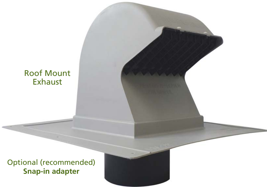
Roof Mount Exhaust