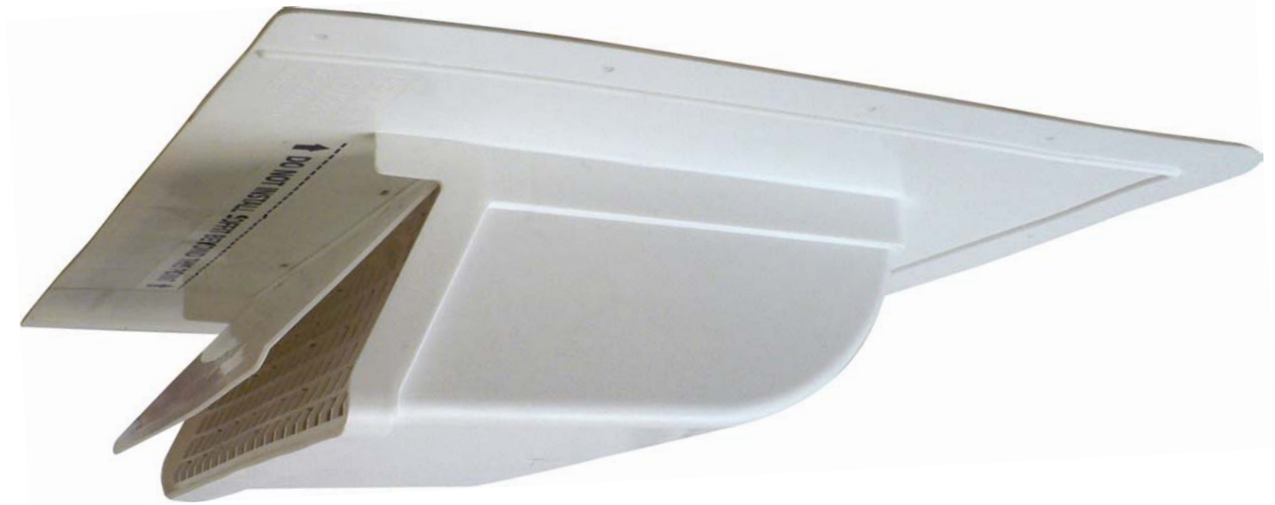
Optional Snap-in Adapter