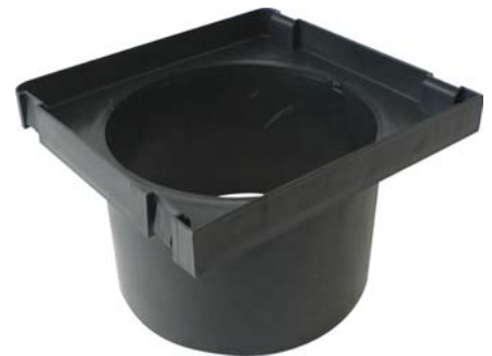
RV28-6 - 6" diameter Snap-in Adapter