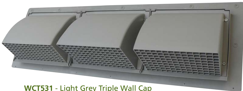
WCT531 - Light Grey Triple Wall Cap