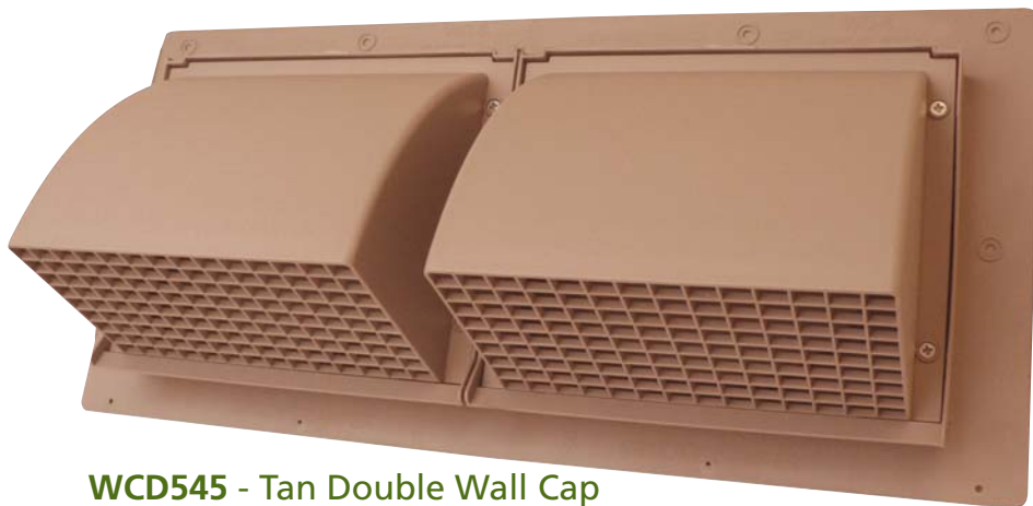
WCD545 - Tan Double Wall Cap