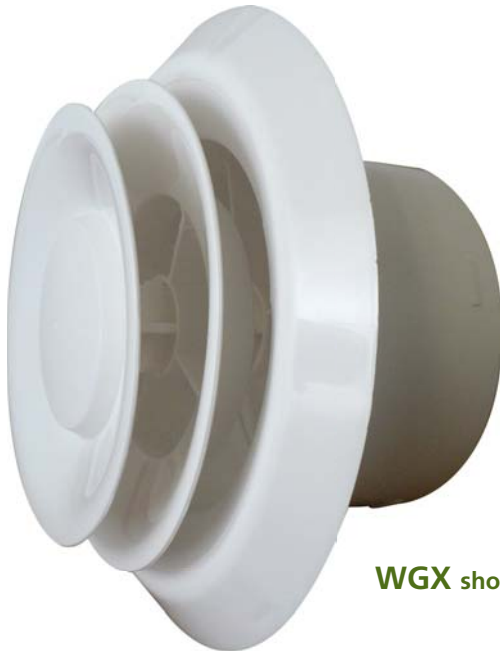
WGX shown open