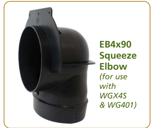
EB4x90 Squeeze Elbow (for use with WGX45 & WG401)