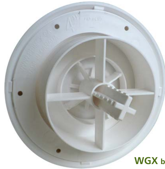
WGX back view