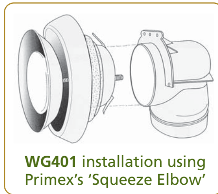
WG401 installation using Primex's 'Squeeze Elbow'