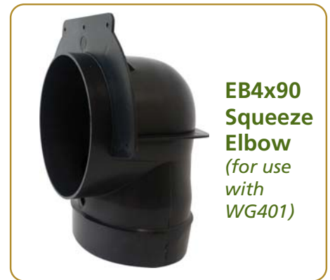
EB4x90 Squeeze Elbow (for use with WG401)